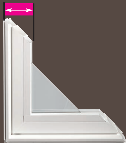
Standard Window Profile