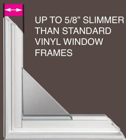
New Contemporary Series Window Profile

UP TO 5/8" SLIMMER THAN STANDARD VINYL WINDOW FRAMES