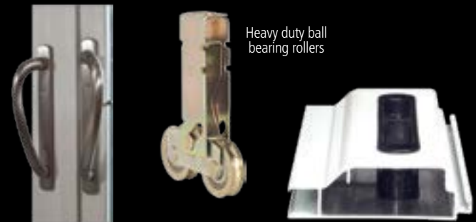
Available in White, Brushed Nickel, Antique Brass, Faux Oil Rubbed Bronze

The bold new screen design was created to eliminate bending and flexibility. The screen has a large extruded frame for increased rigidity and easy operation. Your screen door will slide open and closed with ease and grace.