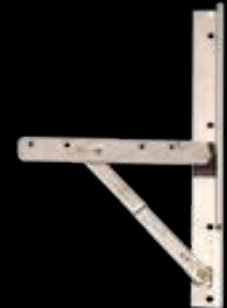
Our 'Heavy-Duty' Hardware