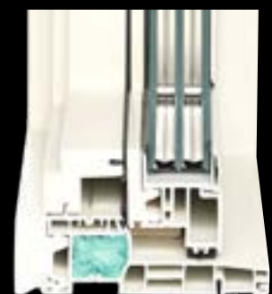
Our foam filled chamber