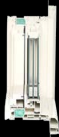
Our 'True-Triple' Glass